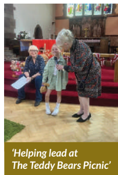
'Helping lead at The Teddy Bears Picnic'